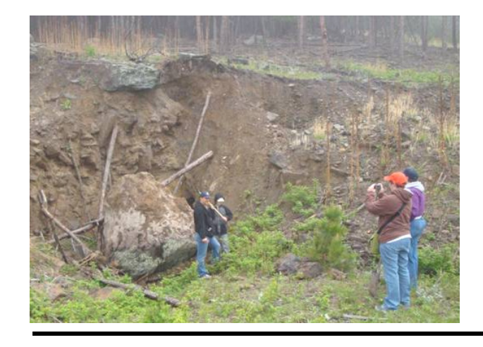
Photo of Lew Wight - Last months issue at time of printing the article about Lew we didn't have a photo so here it is.