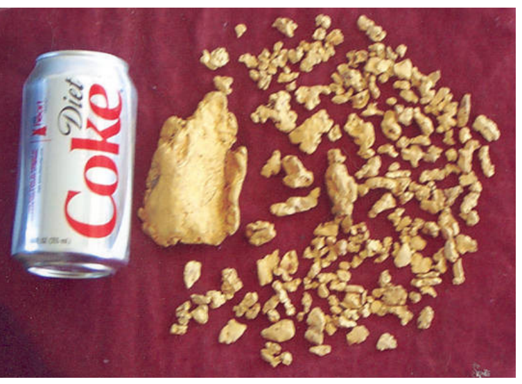
Gold found on a private claim found by the claim owners!