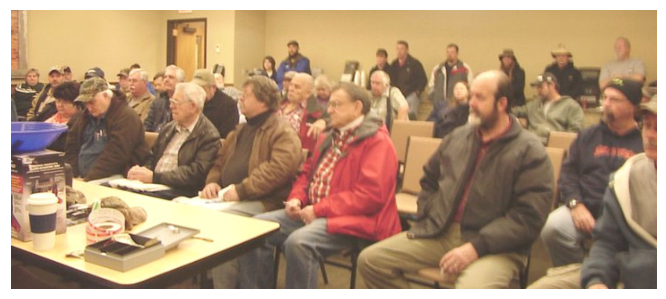
You can see all the photos from this year on our website.