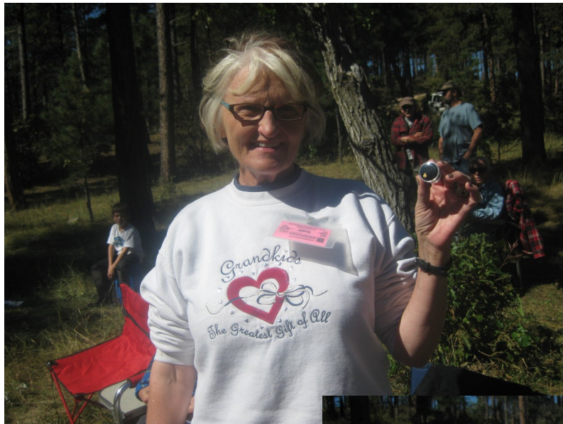
It was Ladies day at the Garnet Saturday. All the Nuggets were won by the Ladies.